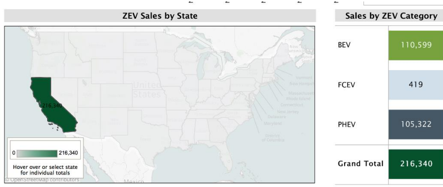
Figure A4: 2016 California Market Share (by May 2016)