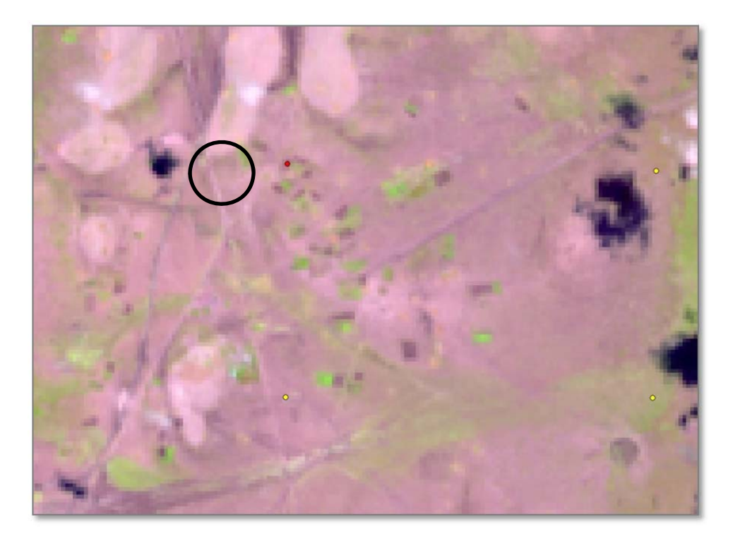
Landsat Image from southeastern Kenyan grasslands where conversion can be easily identified using shape, texture and context. Here, the dot which fell on a converted area was classified as "converted" and shown in red.