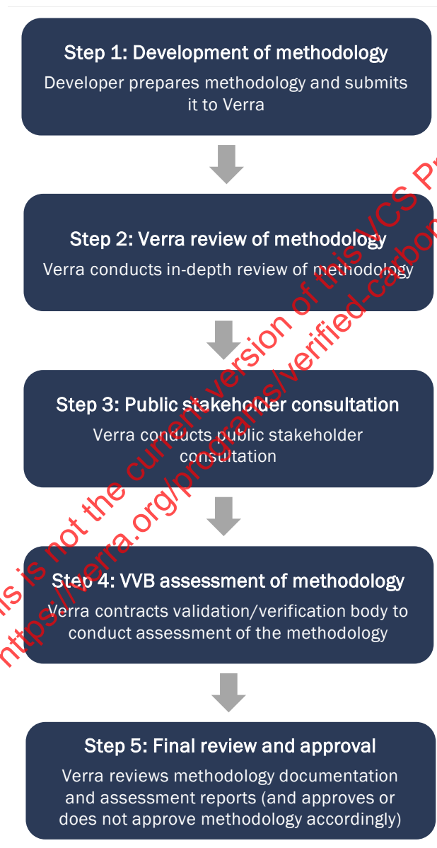
Diagram 2: Steps in the Methodology Approval Process

This is not the current version of this VCS Program document. The current version is at: https://verra.org/programs/verified-carbon-standard/vcs-program-details/