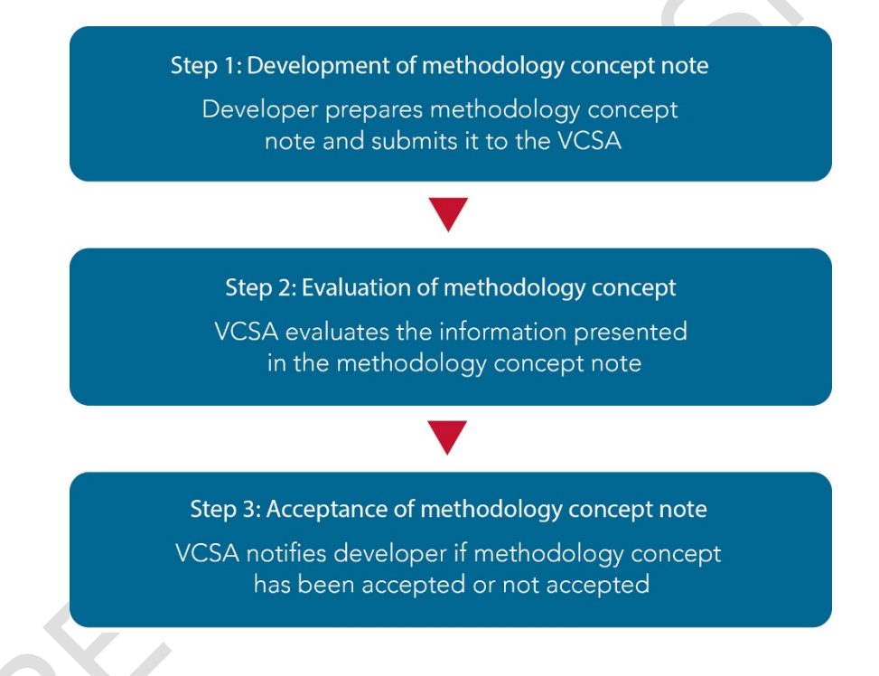
Diagram 1: Steps in the Methodology Concept Acceptance Process

Diagram 1 summarizes the methodology concept acceptance process, which is further described in the sections that follow.