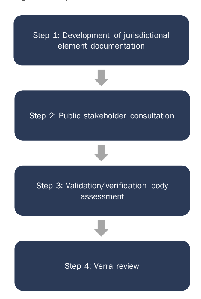
Diagram 1: Steps in the JNR Validation and Verification Process

Diagram 1 summarizes the JNR validation and verification process, which is further described in the sections that follow. Jurisdictional elements may undergo validation and verification separately or at the same time.